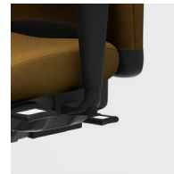
SSP - Sliding seat mechanism

United Chair® products are GREENGUARD® Indoor Air Quality and Children and Schools certified. United Chair® products comply with ANSI/BIFMA X5.1-2002 and ISO 14001:1996 standards. Information contained herein is subject to change without notice.