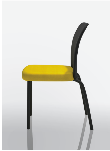
ON31-DP - Maharam MG054 Lumine & ONBK Polypropylene Back Shell