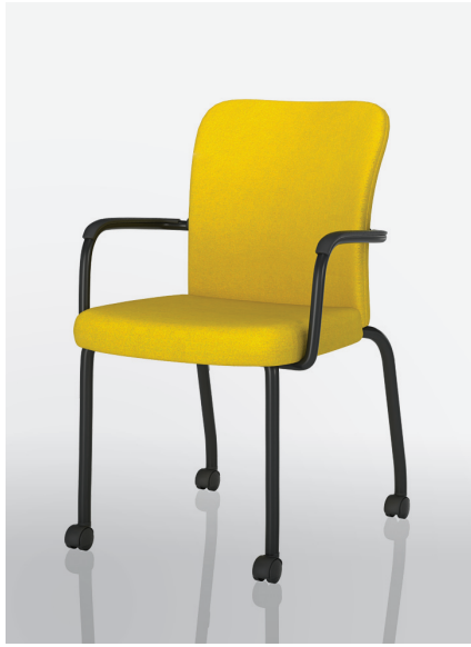
ON34C-DP - Maharam MG054 Lumine