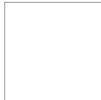
ONWH - White