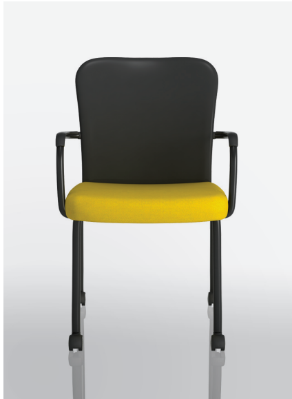
ON32C-DP - Maharam MG054 Lumine & ONBK Polypropylene Back Shell