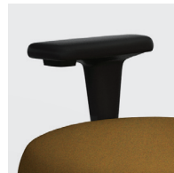
RPA Arms - Optional height and width adjustable arms with pivoting armrests