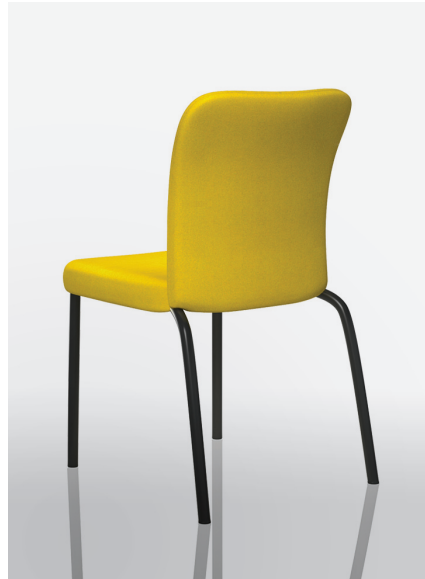
ON33-DP - Maharam MG054 Lumine

Onyx™ guest seating is available with an optional polypropylene back in a choice of three colors. And whether you prefer casters or glides, arms or armless versions, Onyx™ is a chair ready to meet a significant range of needs.